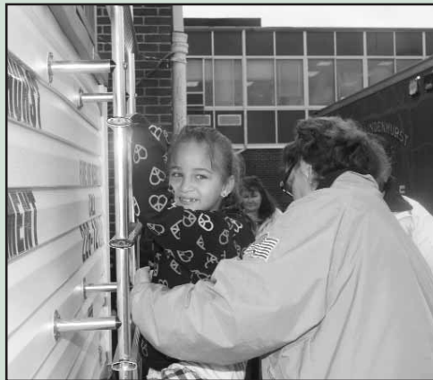
A William Rall first grader climbs down a ladder with help at the fire safety demonstration.

The smoke house is a trailer designed to show students what to do in a fire. Fake smoke, imitating a real fire, poured from the house. Students were shown how to drop to their knees, go to the nearest door, and exit promptly. They were then given a detailed