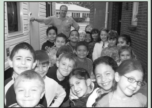
Smiling William Rall first graders learn about fire safety.

The North Lindenhurst Fire Department visited students at William Rall Elementary School to discuss fire safety and to demonstrate what should be done in case of a fire. Students attended a short assembly on the importance