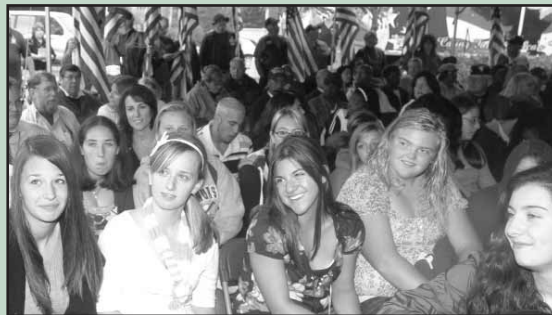
LHS students at the Riverhead Post Office Dedication.