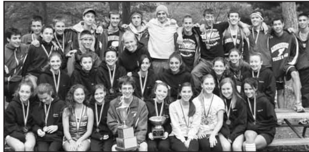
The Lindenhurst High School Boys and Girls Cross-Country teams at the Babylon Bowl tournament.