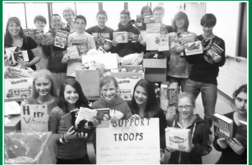
Lindenhurst Middle School students with the packages of food and other items for our military troops overseas.