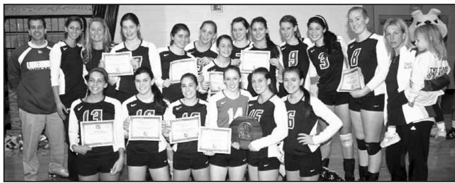
The Lindenhurst High School Varsity Girls Volleyball team after their victory against Massapequa to win the Class AA Long Island Championship.

"We had another outstanding performance by these girls and their coaches. Kudos to the parents and spectators who displayed incredible