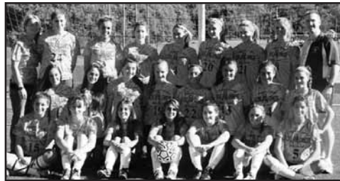
The Lindenhurst High School Varsity Girls Soccer team raised money to support Kicks for Cancer.

The Lindenhurst Girls Soccer team was one of more than 20 teams throughout Suffolk County who are participating in Kicks for Cancer. Team members wore pink tie-dye shirts, and the stands were decorated with pink and white balloons. The team also conducted a raffle to raise additional money during a recent home game.