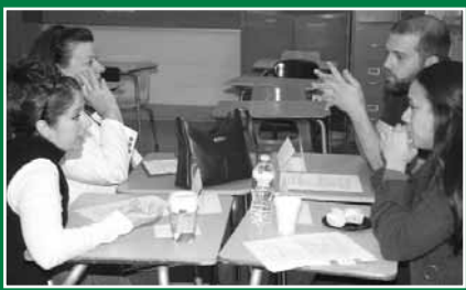
Lindenhurst English teachers discussion group session at Superintendent's Conference Day.