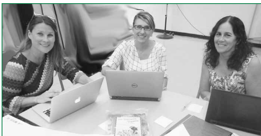
Teachers throughout the district have been preparing for certain curricular changes through a variety of professional development workshops.

Staff members throughout the district have been preparing for these changes by taking part in professional development workshops led by teachers, authors and field experts nationwide. The training promotes the success of the district's new initiatives, and more importantly, the success of its students.