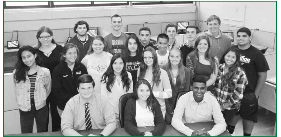
Lindenhurst High School students enrolled in the Virtual Enterprise International course have created their own virtual business and will experience all of the challenges faced by an actual startup company.

One such example of this is the change that occurred in Commissioner's Regulation Part 154, which establishes the legal requirements for the education of English language learners. Those changes, which went into full effect in September, require