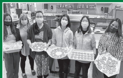
Members of the LindenHurst High School Paw Patrol club recently sold animal treats, including dog biscuits they baked using natural ingredients, as part of a fundraising effort benefiting local animal shelters. Approximately $130 was raised to help animals in need.