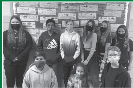
Seventh grade English language learners at LindenHurst Middle School recently worked on scale drawing projects in their math class. Each student chose a different language in which to label their respective sea creatures. The projects were displayed proudly in the east hallway.