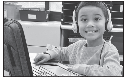
* This photo was taken on Jan. 25, 2022, when face coverings were made optional.

This edition of the Lindy Spotlight will