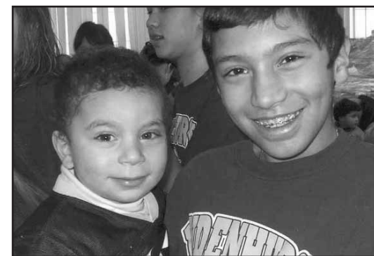
Lindenhurst Middle School students visit with students at the AHRC School in Brookville.