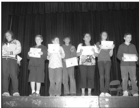
Some of the Lindenhurst Middle School award recipients display their certificates.