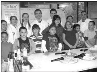
Lindenhurst High School culinary students and E.W. Bower Elementary students learn about healthy cooking.

Lindenhurst High School culinary students recently educated students from E.W. Bower Elementary School about healthy cooking. Together the students prepared and enjoyed vegetables and dip, cheese and crackers, and fruit and yogurt dip. As a treat, for dessert, the students loved making and eating s'mores together.