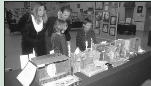
A Lindenhurst family admires artistic dioramas at Celebration of the Arts.