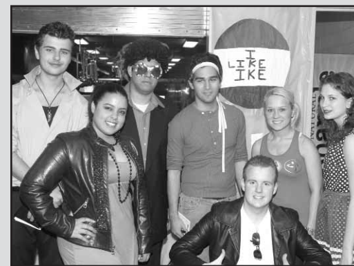
Members of the Blast from the Past team enjoyed learning about restaurant management.