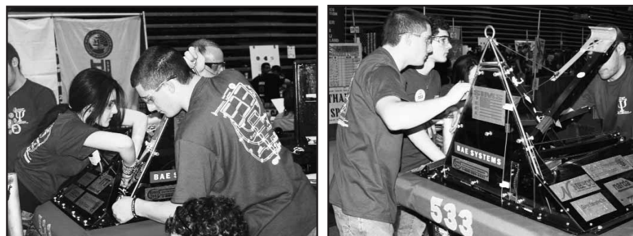
Members of the Lindenhurst High School Robotics Team at the recent FIRST competition.