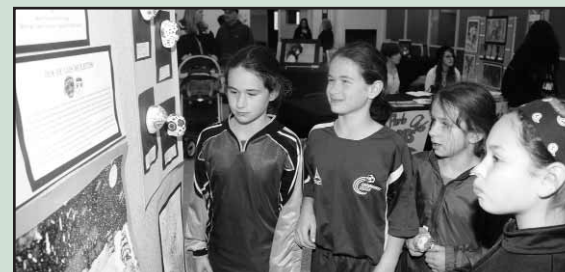
Lindenhurst students view artwork at Celebration of the Arts.