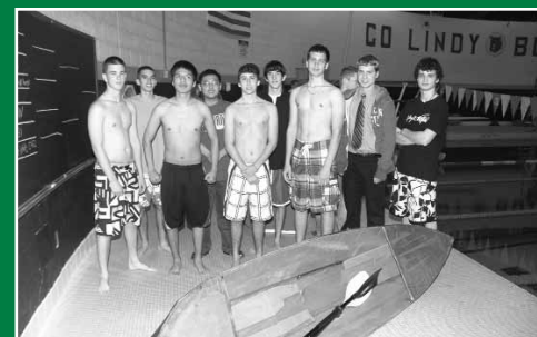
A group of students pose before the Lindenhurst High School regatta races.