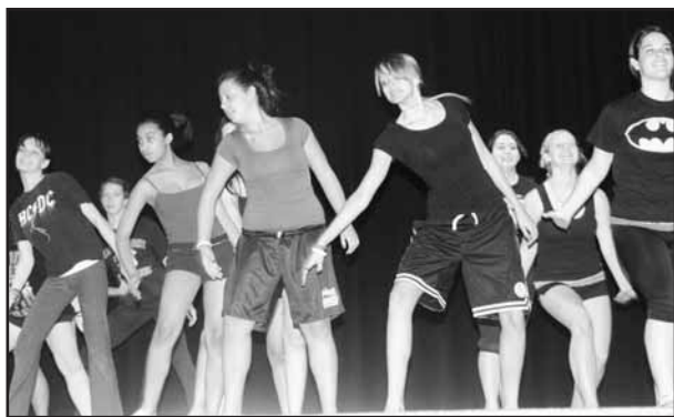
Dance students practiced for months in preparation for their Evening of Dance performance.

"The girls put their heart and souls into this performance," exclaimed Ms. Lyons. "More than 75 girls performed in 16 numbers."