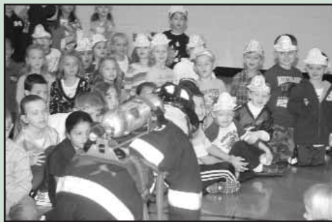
Lindenhurst volunteer firefighter shows how to crawl during a fire.