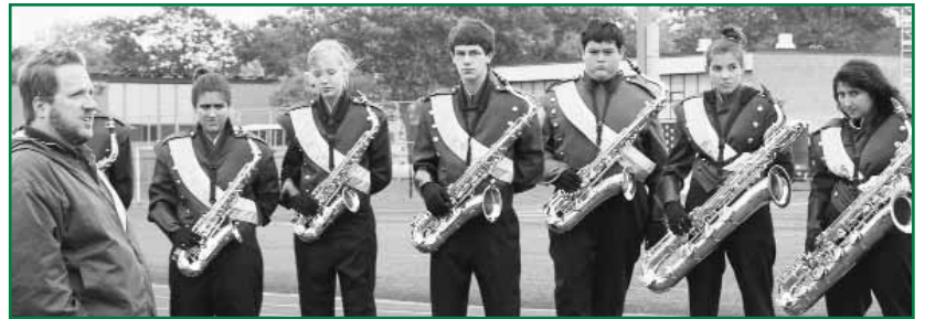
The Lindenhurst High School Marching Band at homecoming.