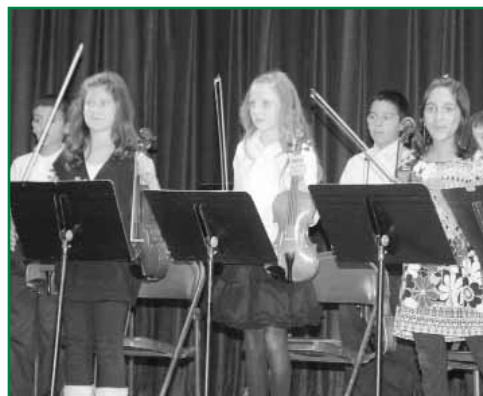
Harding Avenue's select orchestra dedicated their performance to the Lindenhurst Board of Education at the Community Forum.