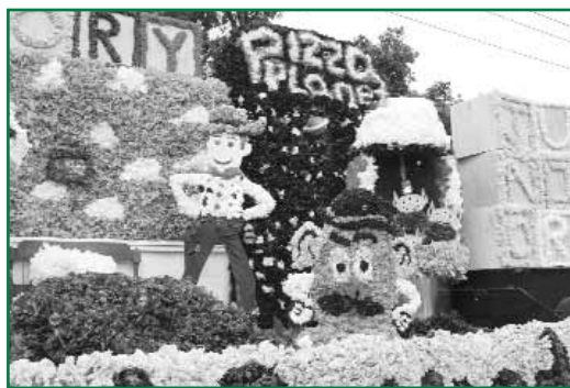
The junior class winning float from Toy Story.