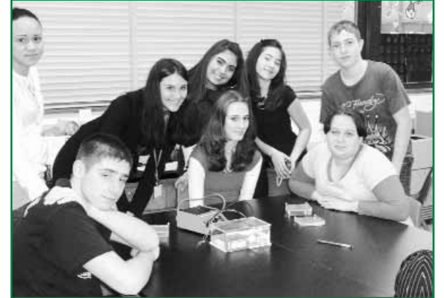
Tenth-grade students in the Living Environment class enjoyed working on a gel electrophoresis lab.