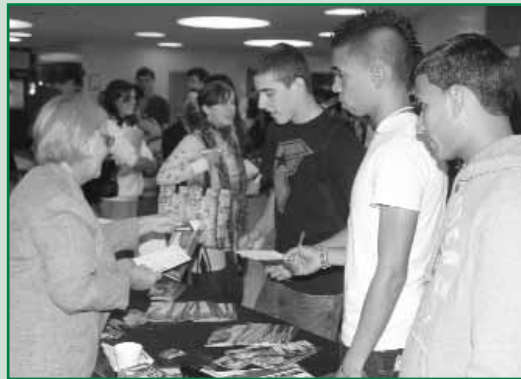
Seniors talk to college representatives about the academic programs they offer.