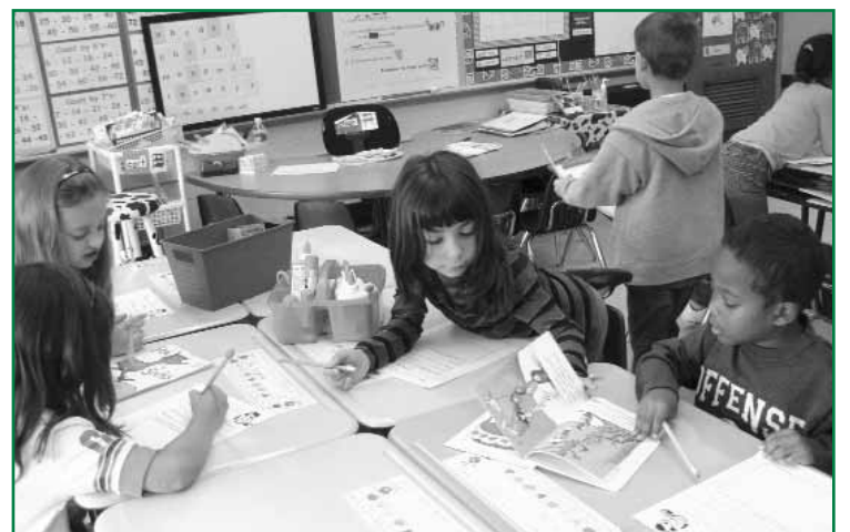
Students log stories at the listening literacy center.