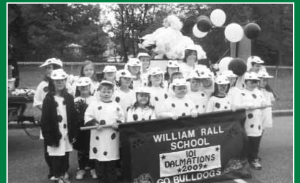
William Rall students march in the Homecoming Parade with the 101 Dalmatians theme.