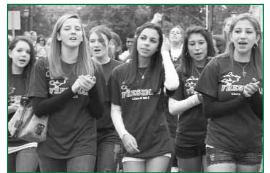
Ninth-grade girls march in the parade.