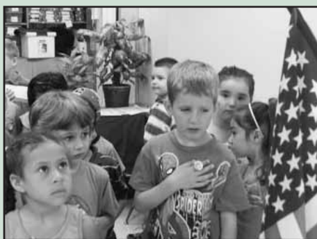
Albany Avenue students practice the Pledge of Allegiance in a special Jump-Start program.