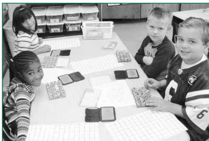
First graders use rubber stamps at the spelling literacy center.

teach them to read using guided reading. At the "listening" center, students first listen to a book on CD and then complete a simple log for that book. At the "spelling" center they use rubber stamps and grid paper to stamp out the spelling words. "The students seem to enjoy the different ways of independent learning to improve their reading," explained Ms. Bohrer.