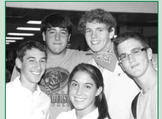
Lindenhurst seniors are all smiles at the mini college fair.