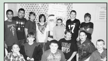
Middle School students pose with Santa at the Holiday Workshop.