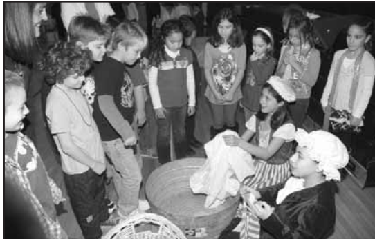
E.W. Bower fifth-grade "Laundry Women" explain clothes washing to younger students at the Colonial Fair.

Students used a researcher's notebook to guide them in the learning process. They researched what typical colonial life was like from 1609-1776. Students were assigned actual "colonial people," and researched information on their person.