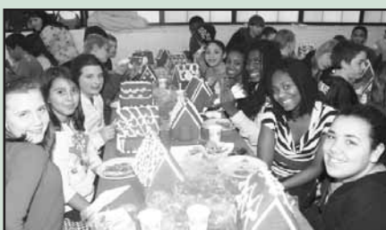
Middle School students make gingerbread houses at the Holiday Workshop.