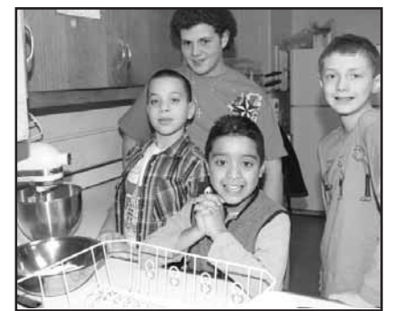
Students make chocolate chip cookies.