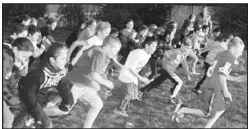
Harding Avenue third, fourth and fifth graders brace the strong winds on the "Walk, Jog, Run Against Hunger."