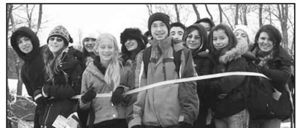
Students enjoyed participating in trust activities such as walking down a hill as a group.