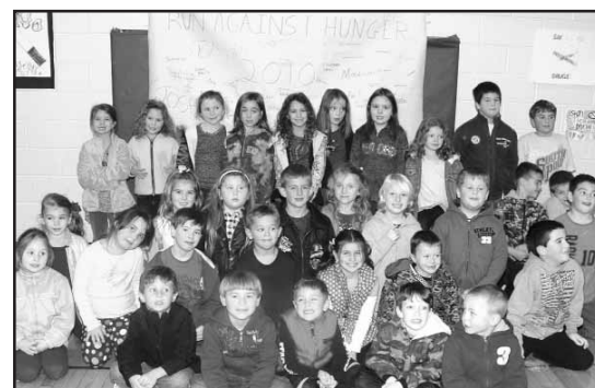
Harding Avenue kindergarteners, first-grade, and second-grade participants in the "Walk, Jog, Run Against Hunger."

The kindergarten, first and second-grade students covered a quarter mile, and the third, fourth and fifth graders covered either a half mile or a full mile, despite a very strong, gusty wind.