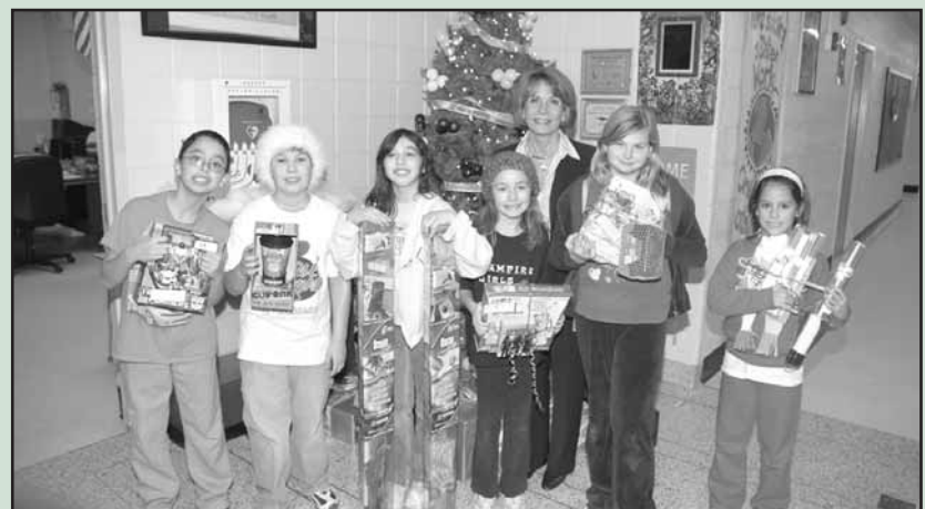
Albany Avenue students with winning toys and baskets from the "Holiday Happenings" Chinese auction.