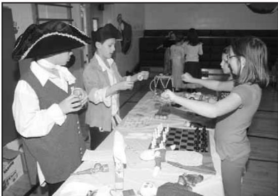
Fifth graders show toys and games at the E.W. Bower Colonial Fair.