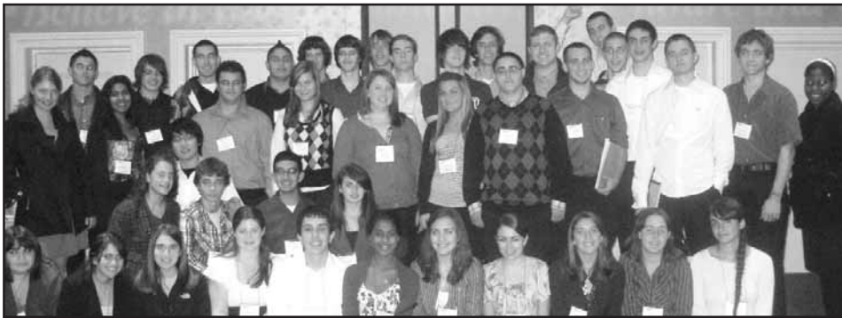
Lindenhurst High School students at the first-ever "Believe Symposium."

Forty Lindenhurst High School juniors and seniors attended the first-ever "Believe Symposium" at the Hyatt Regency in Hauppauge. It was an all-day event created to inspire Long Island high school students, to motivate young adults, help students believe in their communities and focus on career exploration.