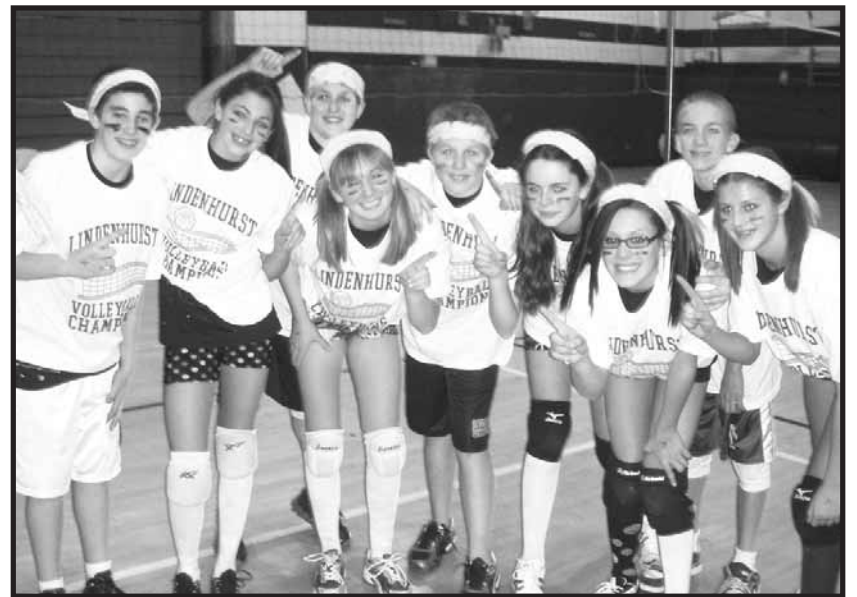
Lindenhurst Middle School's Team Nine after their win at Lindy Pride Volleyball Night.