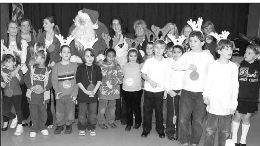
Lindenhurst students enjoyed singing festive songs at the holiday party.

The Lindenhurst School District's after-school recreational program held a special holiday party. Students enjoyed motor activities, board games, and decorating gingerbread cookies. They had the opportunity to sit on Santa's lap, as he distributed candy canes. There was also a sing-a-long of holiday tunes.