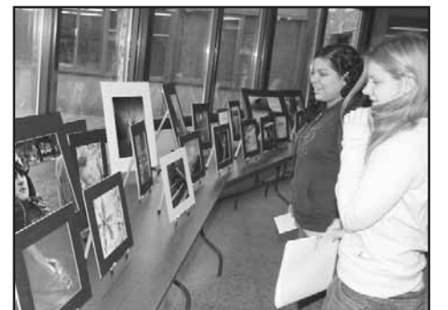
Students admiring art at Lindenhurst High School's Art Fair.