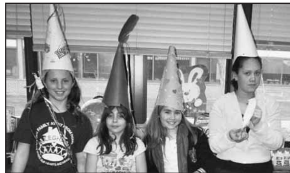
Allegheny Avenue fifth graders with their Harry Potter hats and wands.