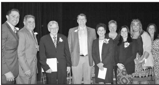
Teachers Association of Lindenhurst members with actor and guest speaker Dan Lauria (second from left).