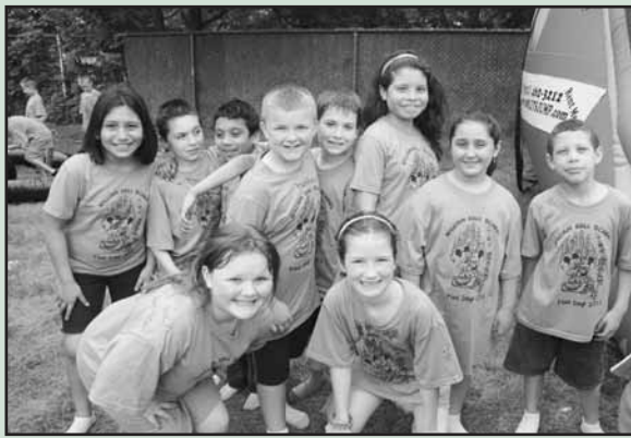
William Rall third graders at Fun Day.