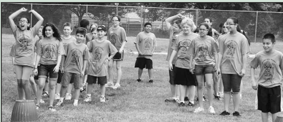
Fifth-grade Rall students get ready for outdoor relays at Fun Day.