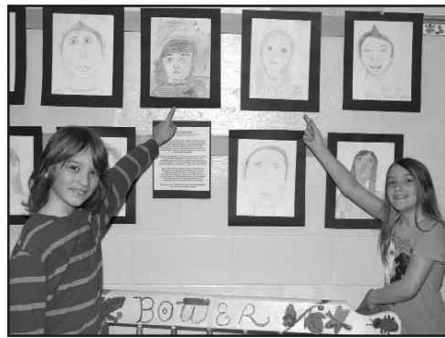
Bower students point to their self-portraits displayed at the Spring Exhibit.