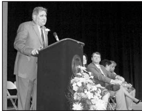
Guest speaker, actor and former Lindenhurst High School student Dan Lauria.