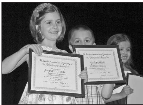
Kindergarten TAL Award winners.