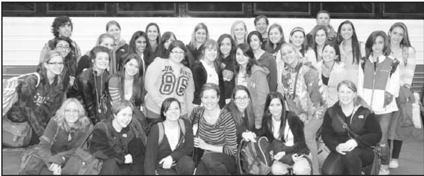
Lindenhurst High School students before their trip to France and Spain.