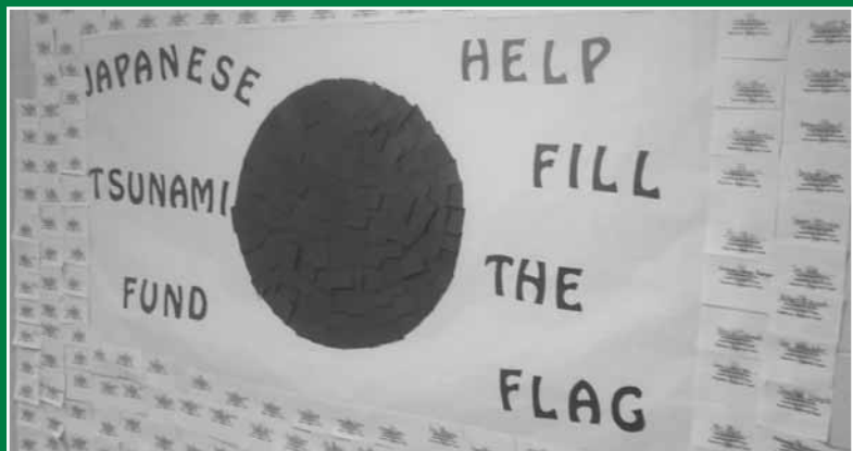
West Gates Student Council's "Fill the Flag" poster.