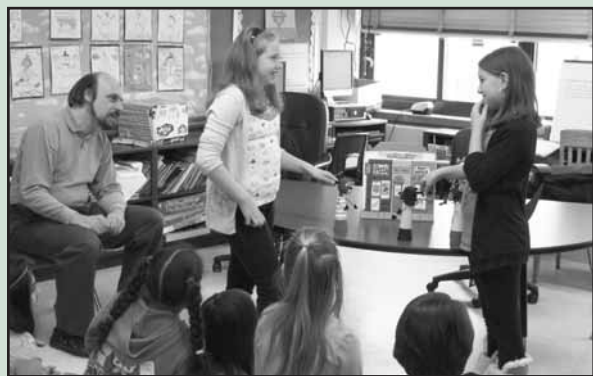
Third-grade students act out bullying issues using character puppets.