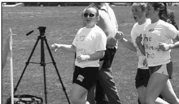
LHS girls cross the finish line at the Triathlon.