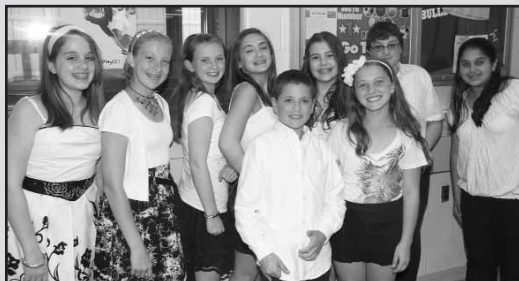
National Junior Honor Society inductees before the ceremony.