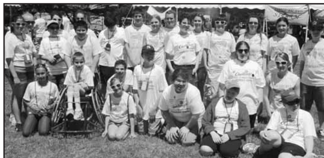
Middle School athletes and buddies at the Special Games.