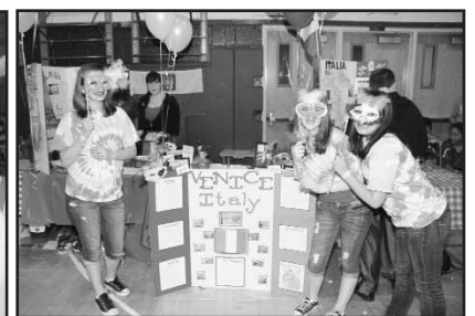
Italian masks at International Day.