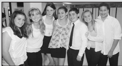
Current Junior Honor Society officers before the induction ceremony.