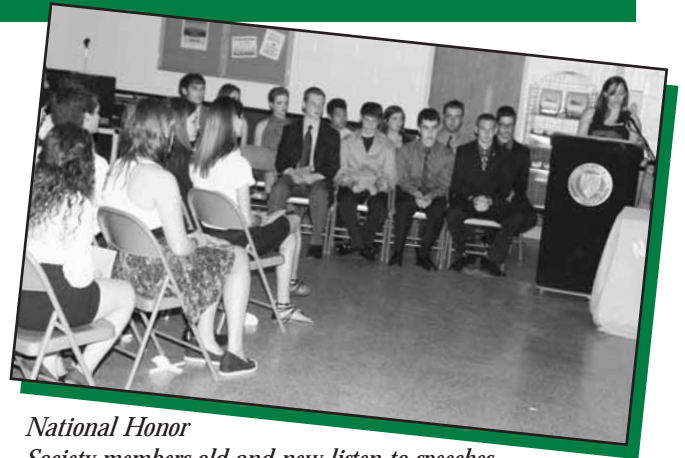
National Honor Society members old and new listen to speeches during the induction ceremony.

The National Honor Society is the nation's premier organization to recognize outstanding high school students. The organization honors those students who have demonstrated excellence in the areas of scholarship, leadership, service and character.