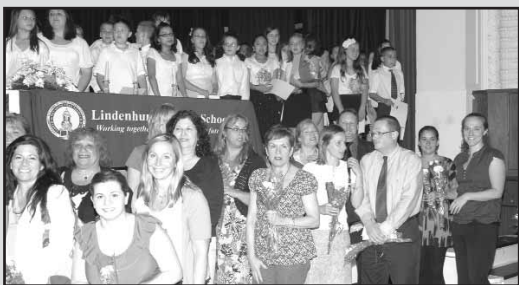
National Junior Honor Society students and guest teachers after the induction ceremony.