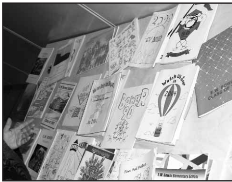
Bower yearbooks on display at Spring Exhibit.

The building was open for tours and Bower memorabilia was displayed in the gymnasium. Old photos, yearbooks, memory books, proclamations, certificates, collages and programs were shown. "It was an emotional evening, as it was Bower's last Spring Exhibit," stated Principal Donna Smawley.