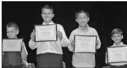
Fifth-grade TAL Award winners.