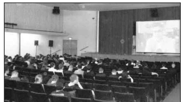
A Skype event with author Garth Stein was held in the Lindenhurst High School auditorium for Lindy's Big Read.