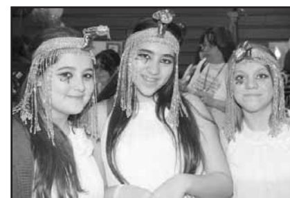
Girls display Egyptian headwear.