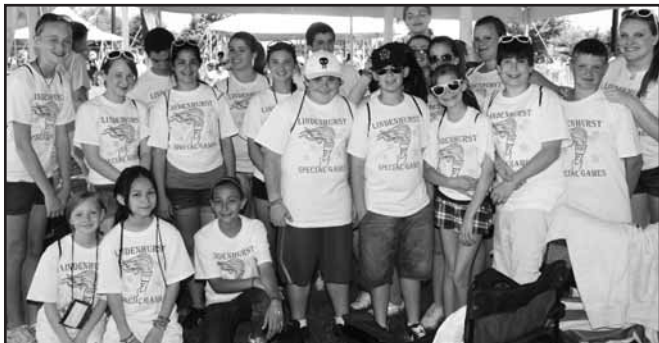
A special thank you to all the Special Games buddies.