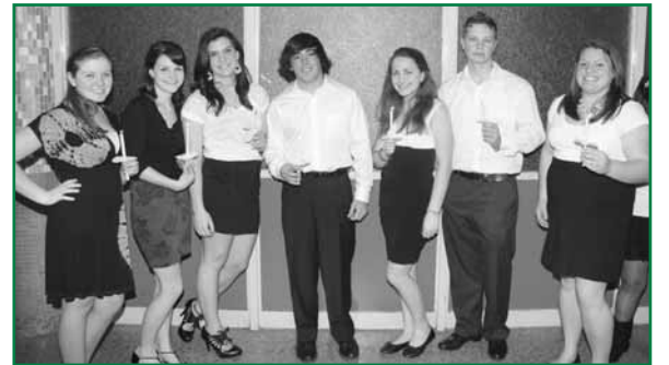
Lindenhurst High School students before the National Honor Society induction ceremony.