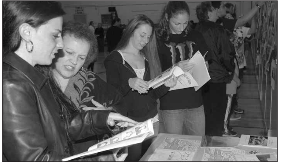
Attendees peruse through old yearbooks at the Spring Exhibit.