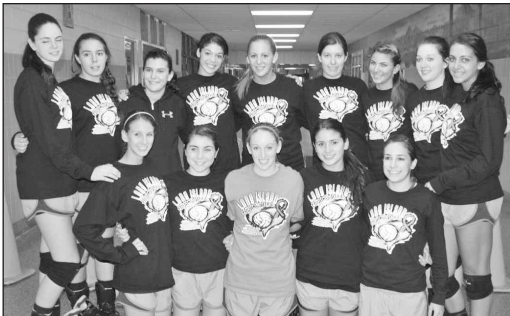
The Lindenhurst High School Varsity Girls Volleyball team was the winner of the Dig Pink Tournament.

The Lindenhurst High School Varsity Girls Volleyball team, dressed in pink and black in support of National Breast Cancer Awareness Month, won the sixth annual Side-Out Foundation's Dig Pink tournament. Sixteen teams participated in the day-long event at the district's high school and middle school. Long and short-sleeved T-shirts were sold to help raise money for the Foundation.