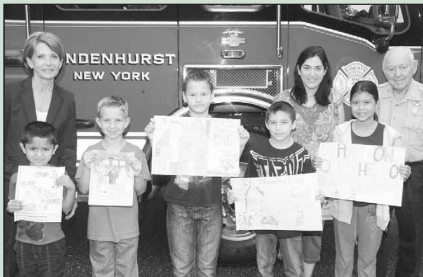
Daniel Street winners

Congratulations to this year's winners in the Fire Prevention Poster Contest sponsored by the Lindenhurst Fire Department.